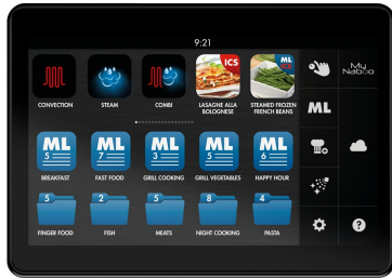
LCD 7" Touch Screen

AUTOMATIC INTERACTIVE COOKING TOUCH SCREEN CONTROLS