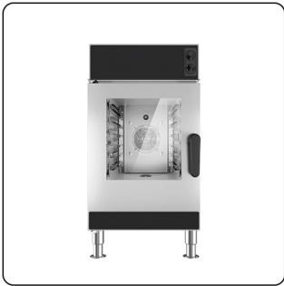
CONSTRUCTION IN FULL AISI 304, WITH FLANGED FEET FOR FLOOR FIXING.