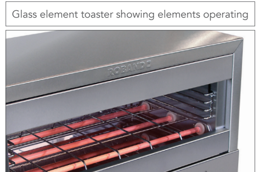
Glass element toaster showing elements operating