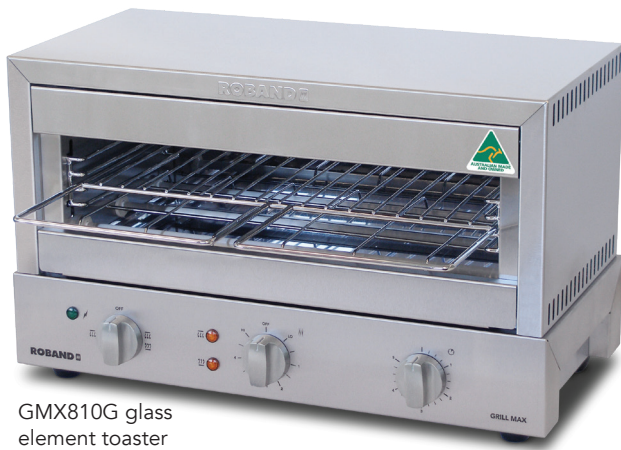
GMX810G glass element toaster